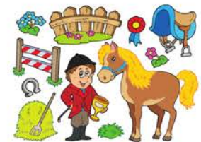
Horse & Pony